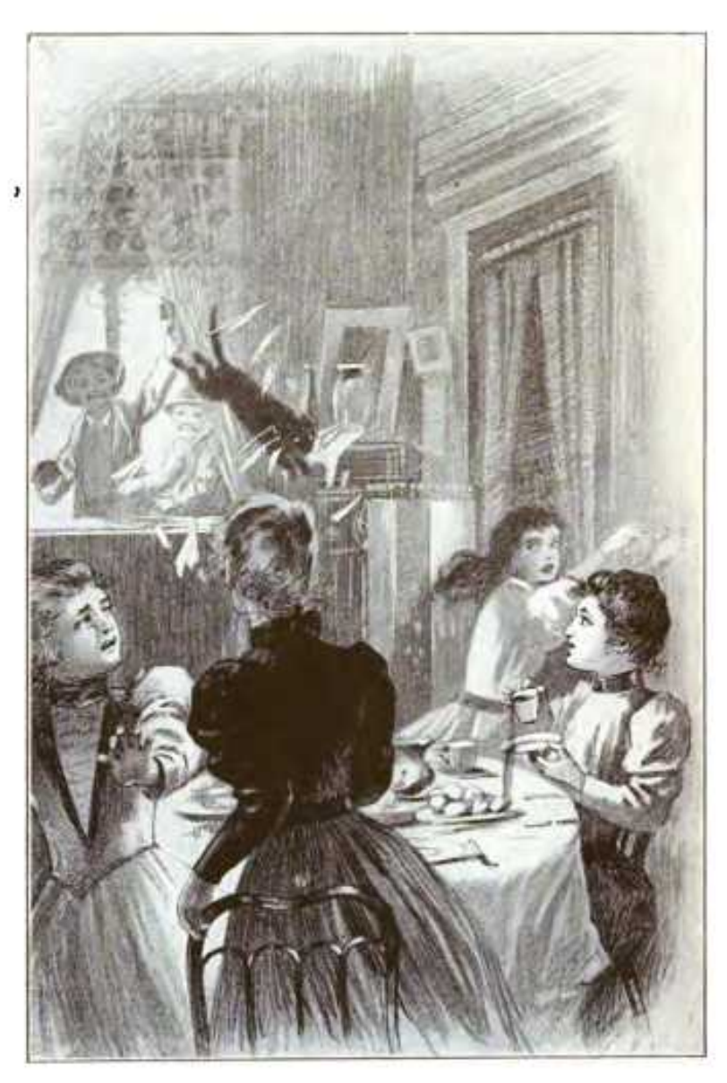
"THE FRIGHTENED ANIMAL PLUNGED INTO THE ROOM." (See page 56.)