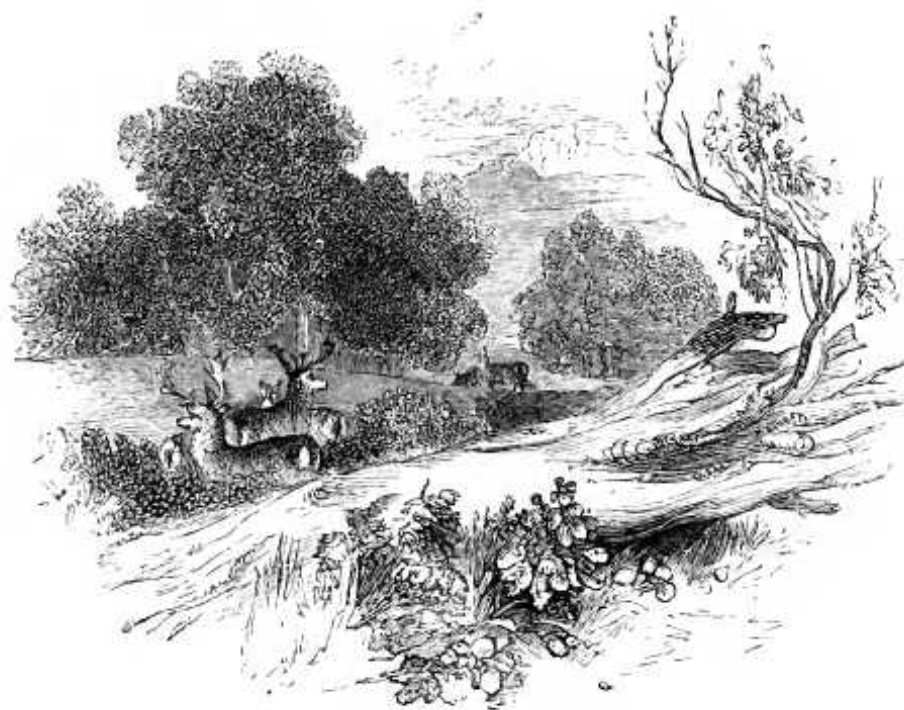
THE FOREST OF ARDEN.