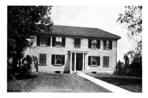
The Crowe House The oldest house in North Plymouth Built in 1664

Pilgrims themselves, accustomed to homes of at least a fair degree of comfort, probably intended that their first rude and primitive huts of logs should give way, as soon as circumstances made it possible, to homes of a more permanent nature. Pilgrim homes still exist, however, in the Crowe house (built 1664) and the Howland house (1666), and both houses were built and lived in by members of the original Mayflower colony. Other homes of the same period, or only very slightly later, are the Kendall Holmes house on Winter