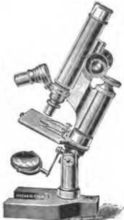
SHOWING OUTFIT NO. 3122

Which is first-class in design and finish, at a reasonable price.