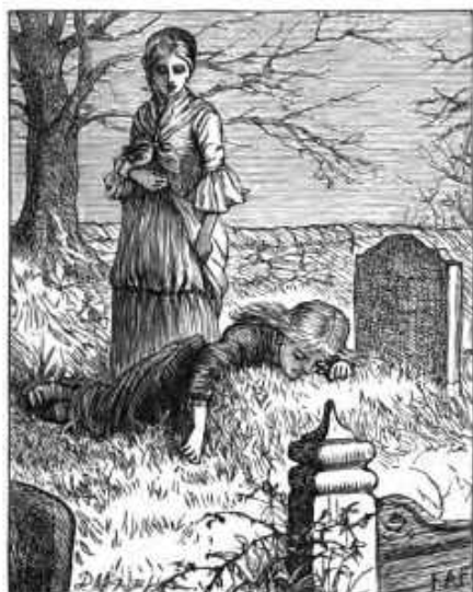
AT JESSIE'S GRAVE.