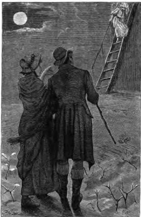
A STRANGE SIGHT.