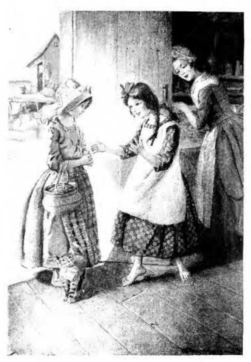
" A WONDERFUL THING IS GOING TO HAPPEN"