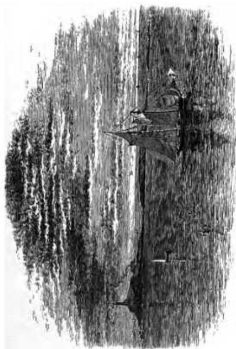
WHITE ISLAND, LOOKING SOUTHWEST FROM APPLEDORE.