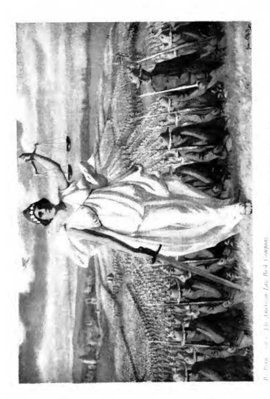
LIBERTY, JUSTICE AND LAW SHVILL WULL