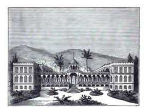
VIEW OF NEW HOTEL AT HAMMAM RIRHA.