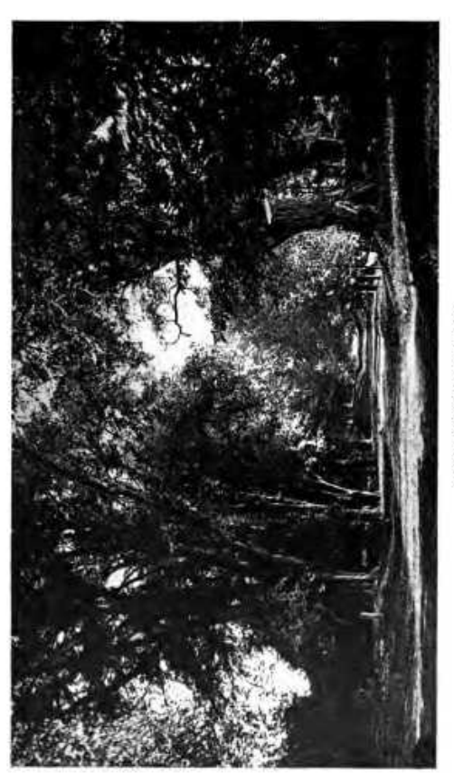
THE VILLAGE STREET