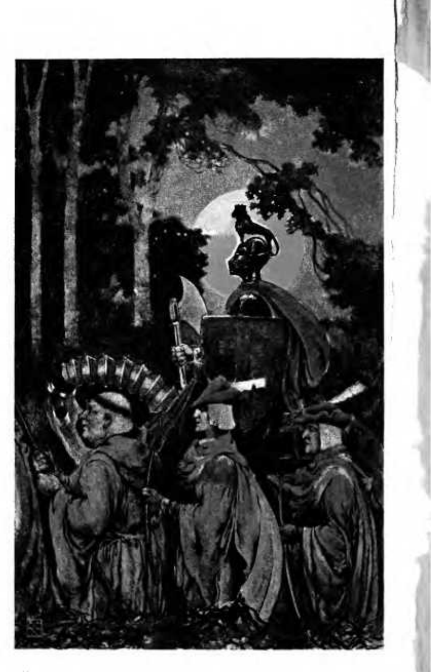
"IT WAS THE KING COME HOME FROM THE CRUSADE"-Page 133