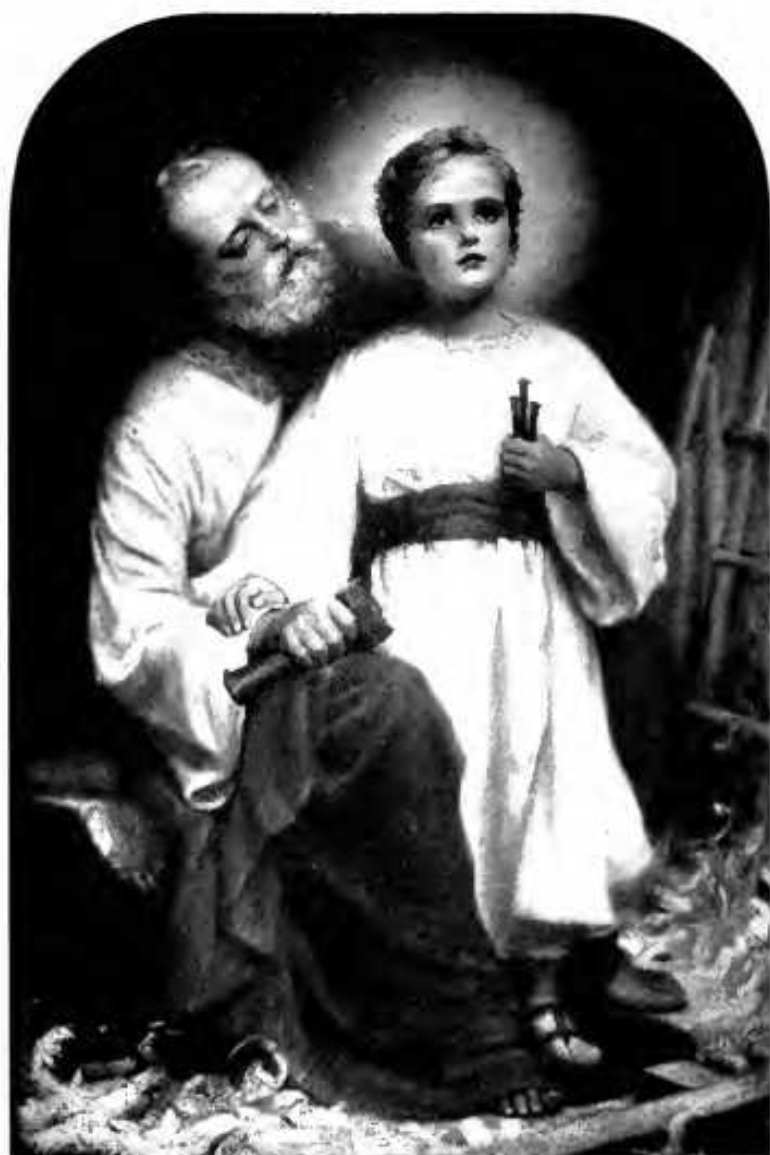
THE WORKSHOP AT NAZARETH

Picture Copyrighted and Owned by A. R. MOWBRAY & CO., LTD., and printed by their permission. E. P. DUTTON & CO., sole agents in America.