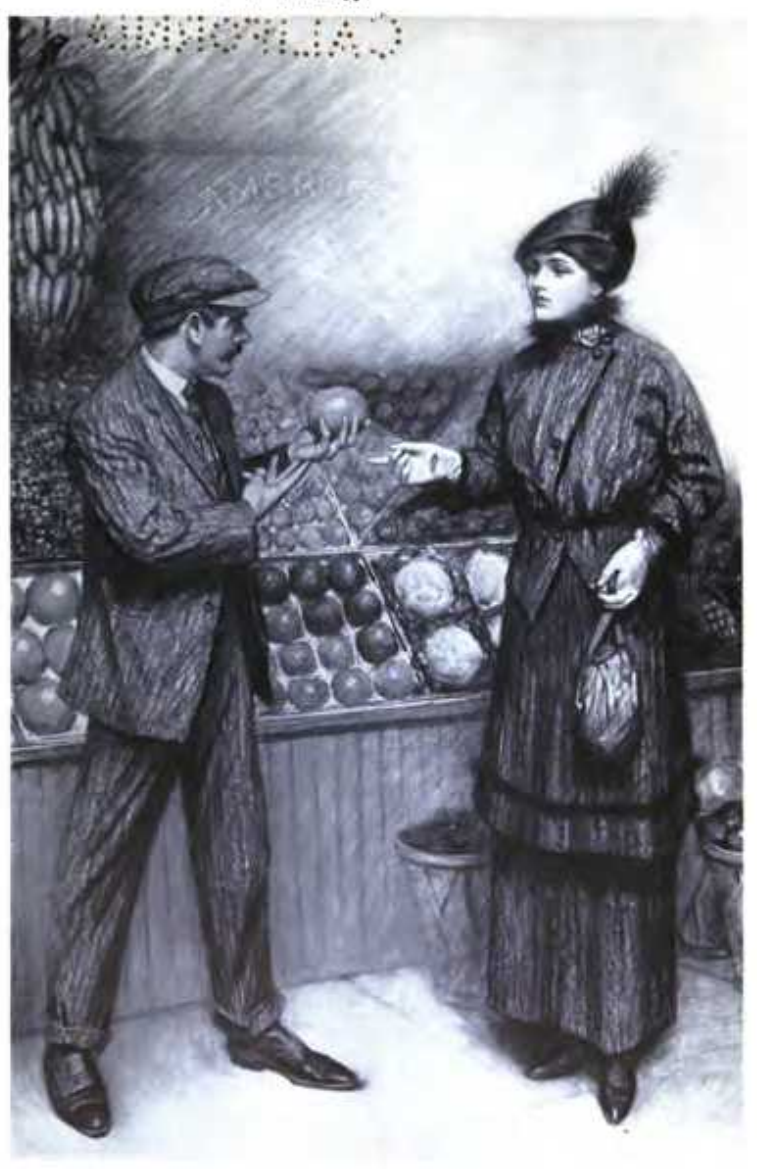
"Pounds! I never weighed them"