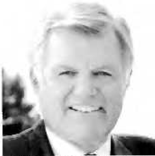
EDWARD M. KENNEDY Hyannisport, Democrat.