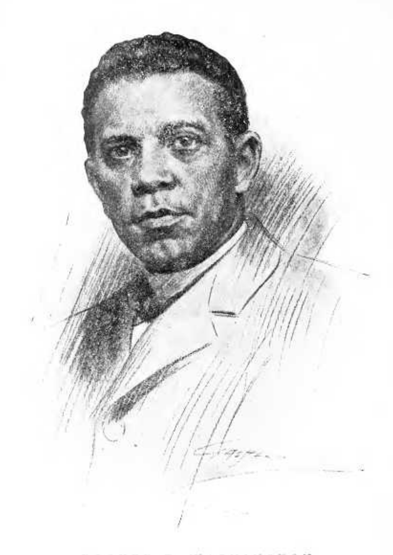
BOOKER T. WASHINGTON