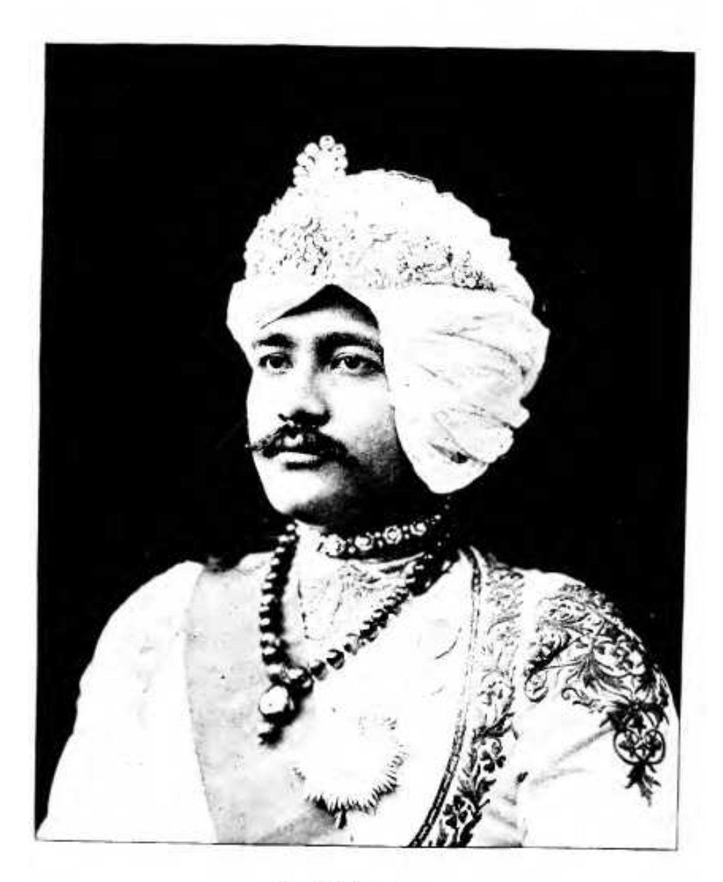
AN INDIAN RAJAH.