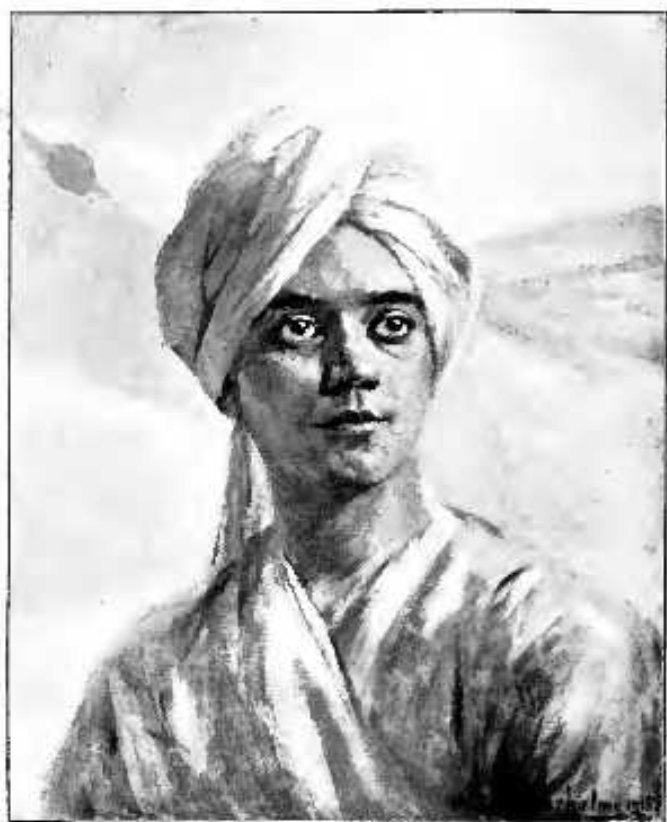
SRĪ ĀNANDA ĀCHĀRYA