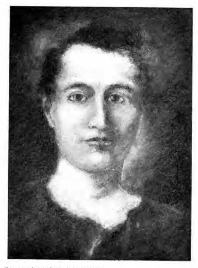
From an oil painting by P. & L. Wells ] JESUS AS HE MAY HAVE LOOKED WHEN A YOUTH.