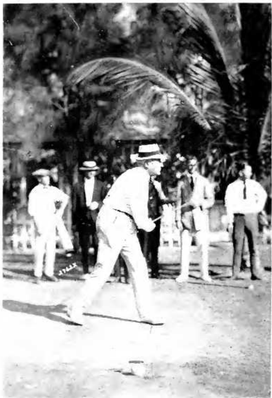
President Harding, an occasional sun-hunter, slices one into the palmettos on one of Miami Beach's three links.