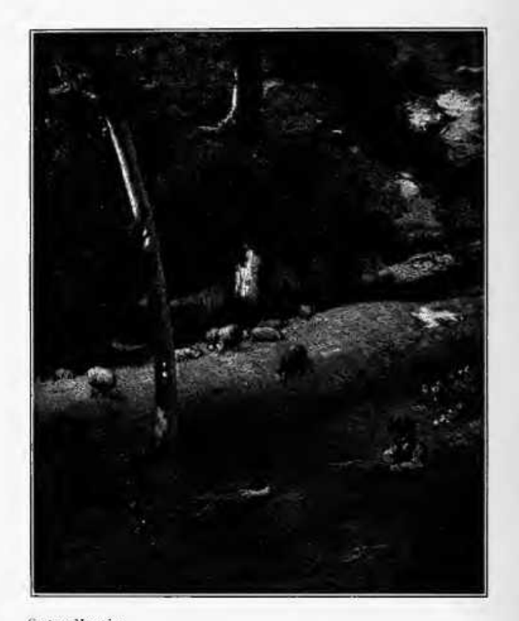
Century Magazine LIGHT AND SHADE — Geo. Inness