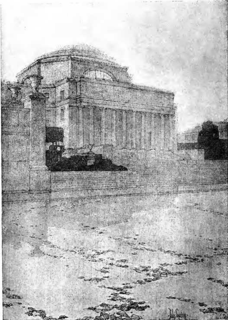
THE LIBRARY OF COLUMBIA UNIVERSITY