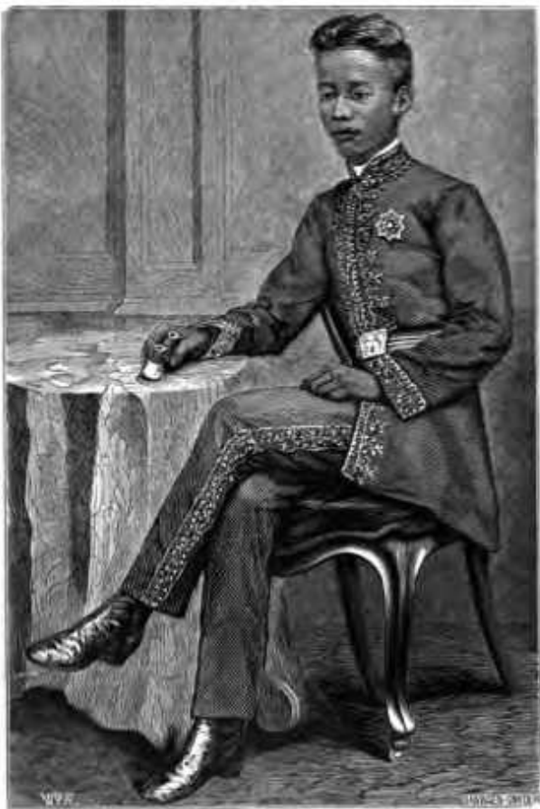
The present King of Siam.