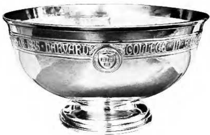
SILVER BOWL PRESENTED TO CLASS SECRETARY JUNE 29, 1910