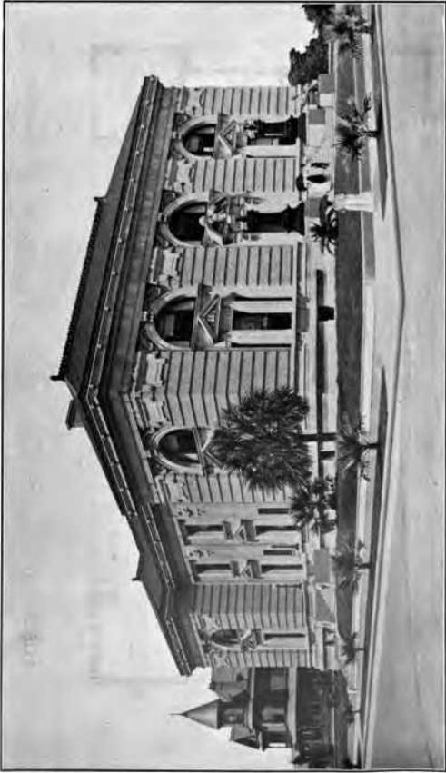
ROSENBERG LIBRARY, GALVESTON, TEXAS