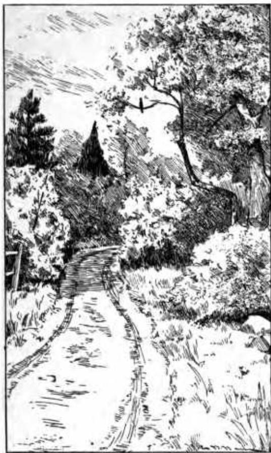
"THAT OUT FROM THE DUSTY HIGHWAY LED."