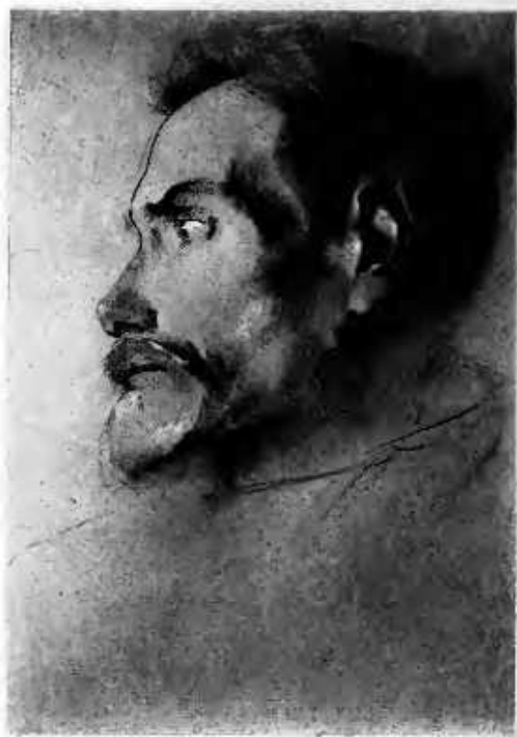
Francis Thompson Drawn by the Hon. Neville Lytton 1907