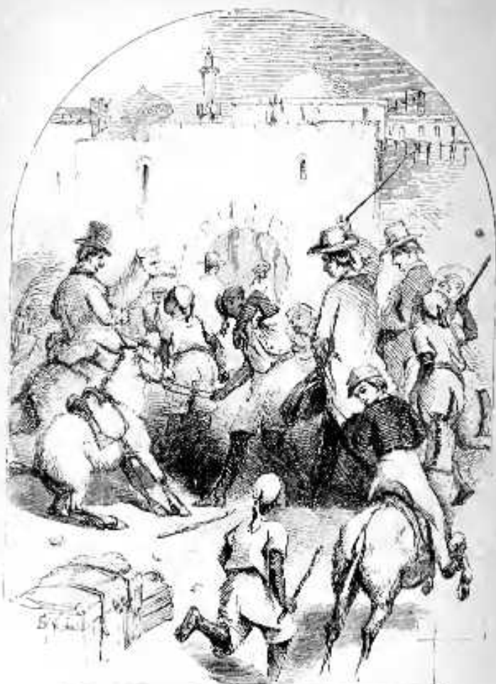
ARRIVAL IN EGYPT.