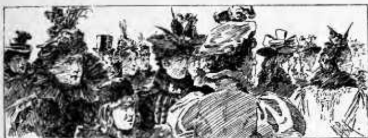
A SKETCH IN REGENT STREET.—Puzzle—On which side are the shop windows?