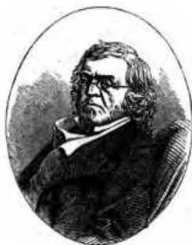
WILLIAM MAKEPEACE THACKERAY.