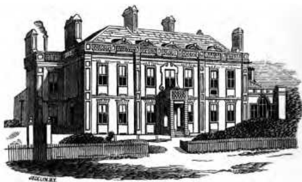
HIS RESIDENCE IN KENSINGTON PALACE GARDENS,