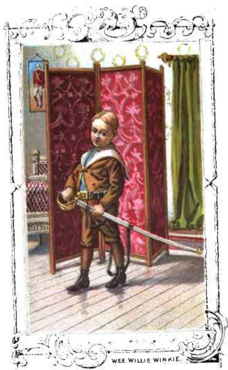
WEE WILLIE WINKIE.