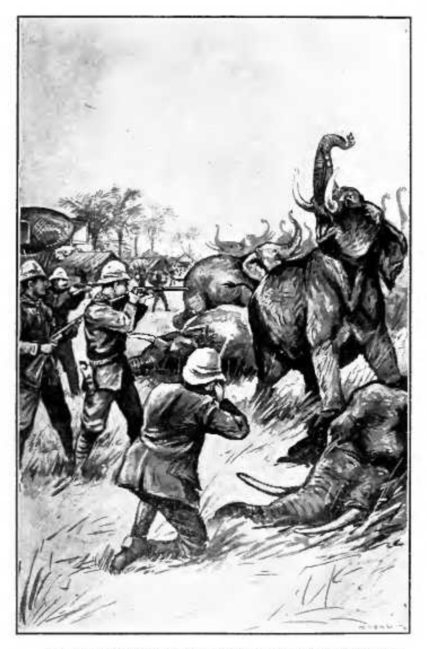
THE ELEPHANTS COULD NOT STAND THE FIRE OF TOM'S ELECTRIC RIFLE.—Page 123. Tem Swift and Hit Electric Rifle.