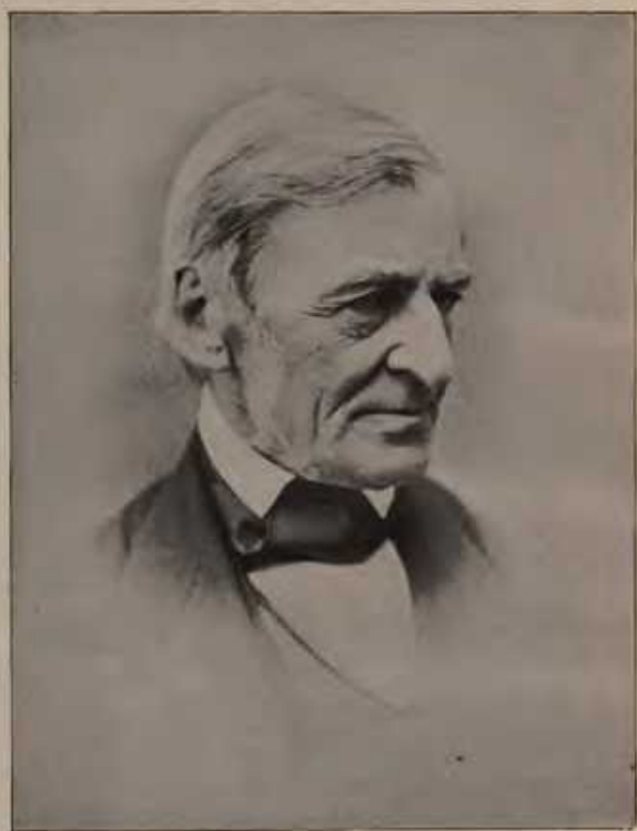
RALPH WALDO EMERSON.