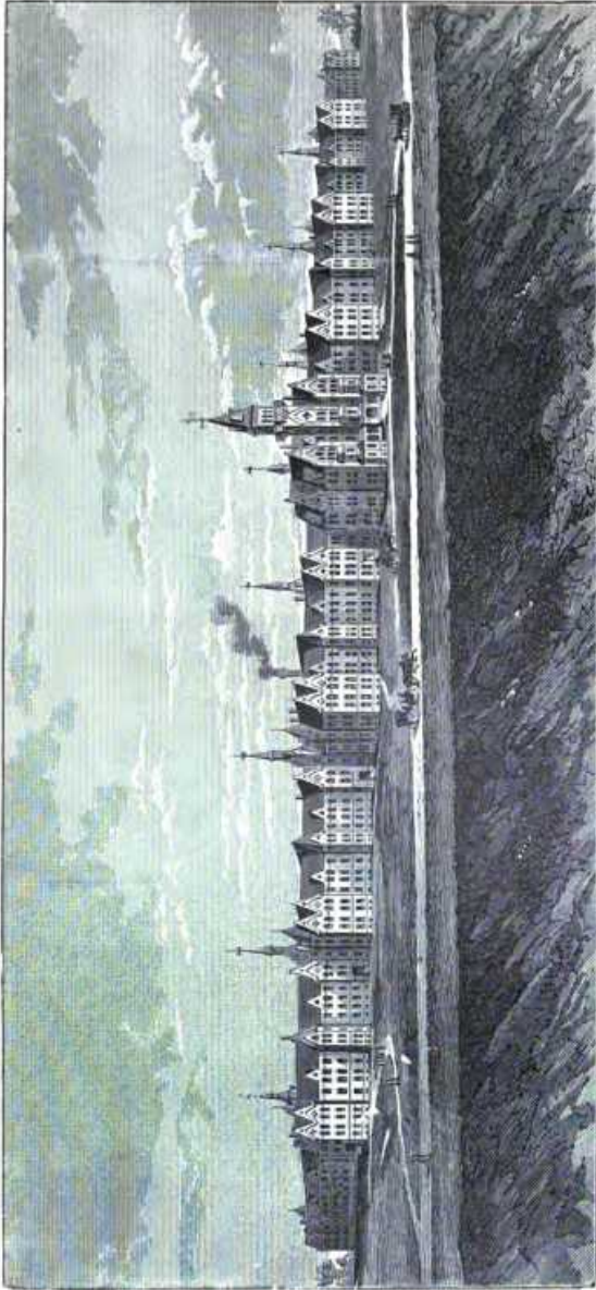
STATE LUNATIC HOSPITAL AT DANVERS.