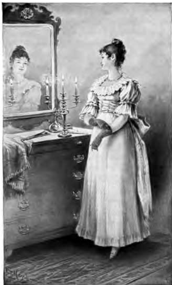
DRESSED FOR HER FIRST PARTY. (Page 2.)