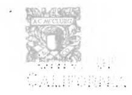
CHICAGO A. C. McCLURG & CO. 1906