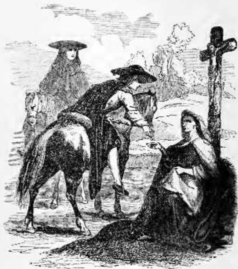
THE THREE WAYFARERS.