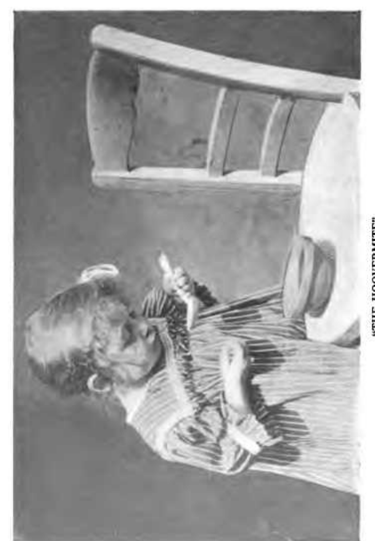
"THE HOOVERMITE" This little Miss Muffit has an American dress and is testing American sugar