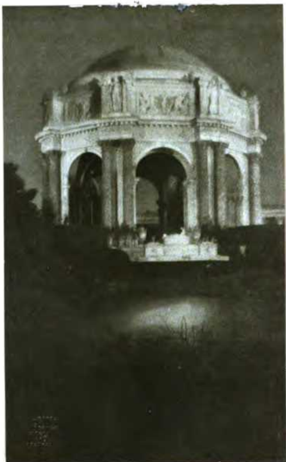
THE ROTUNDA OF THE PALACE OF FINE ARTS A VIEW BY NIGHT