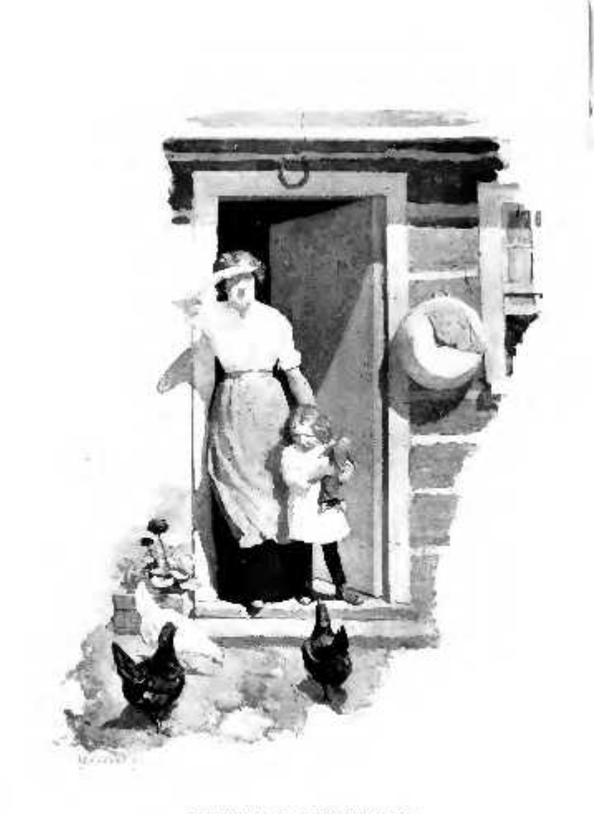
THE WOMAN HOMESTEADER