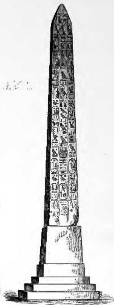
OUR EGYPTIAN OBELISK : CLEOPATRA'S NEEDLE. ENGRAVED FROM A PHOTOGRAPH.