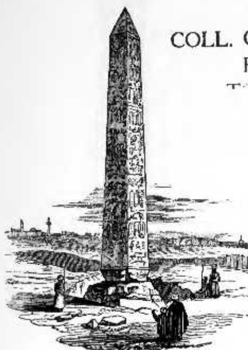
CLEOPATRA'S NEEDLE AT ALEXANDRIA.

LONDON: BRAIN & CO., 26, PATERNOSTER ROW.