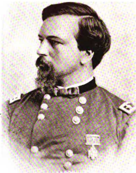
BVT. MAJOR-GENERAL ALEXANDER S. WEBB U. S. A. IN WAR TIME