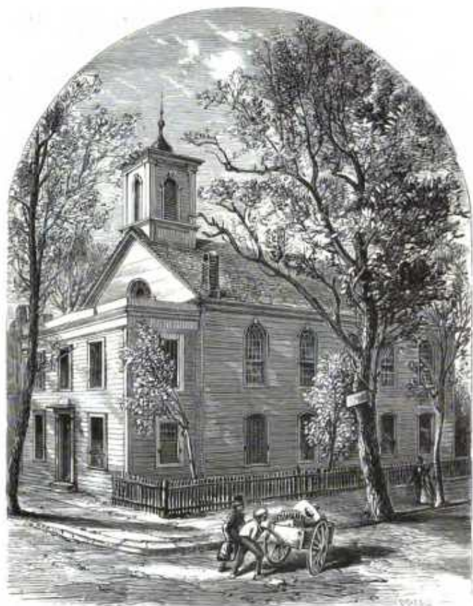
OLD FIRST BAPTIST CHURCH.