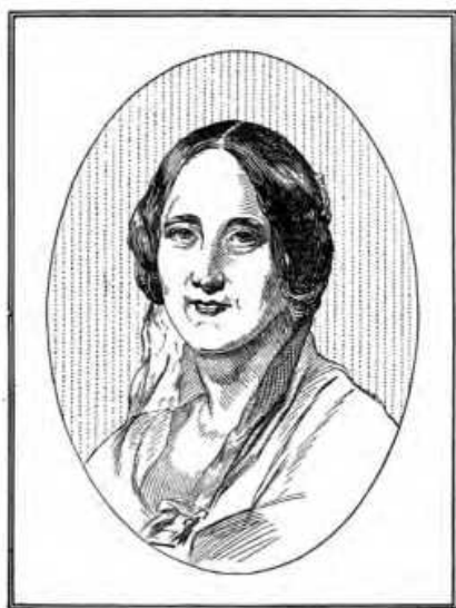
ELIZABETH STEVENSON GASKELL