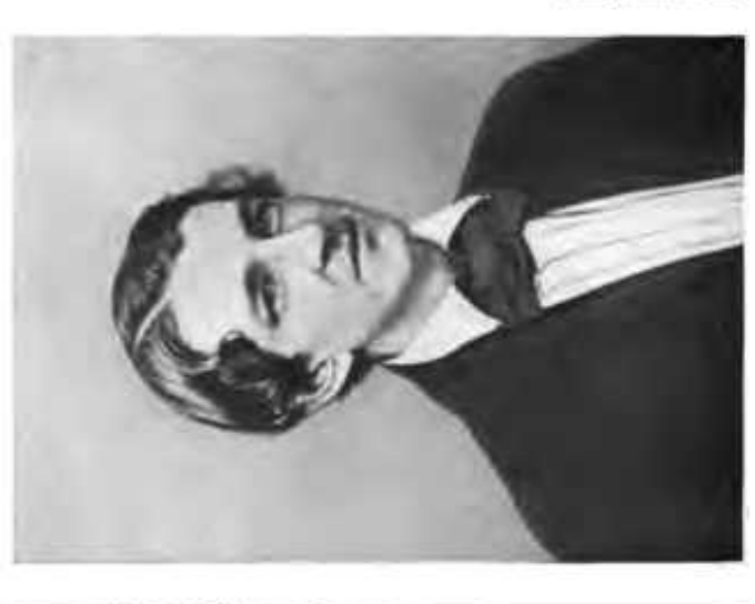
HENRY CLAY TRUMBULL