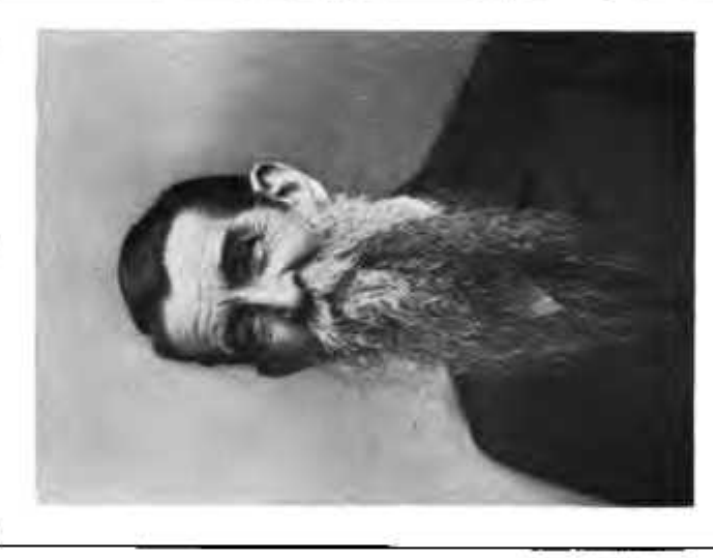
After Fifth Years