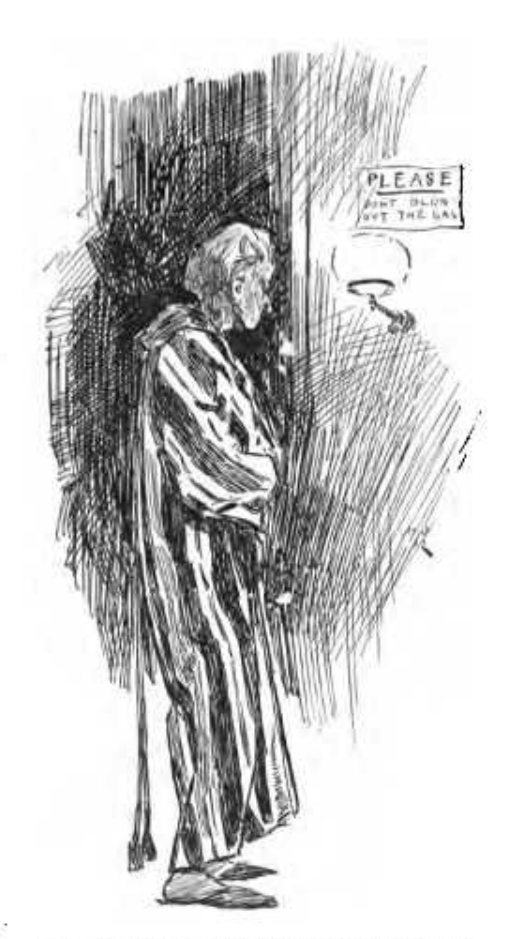
"'I BELIEVE YOU'D BLOW OUT THE GAS IN YOUR BED-ROOM'"