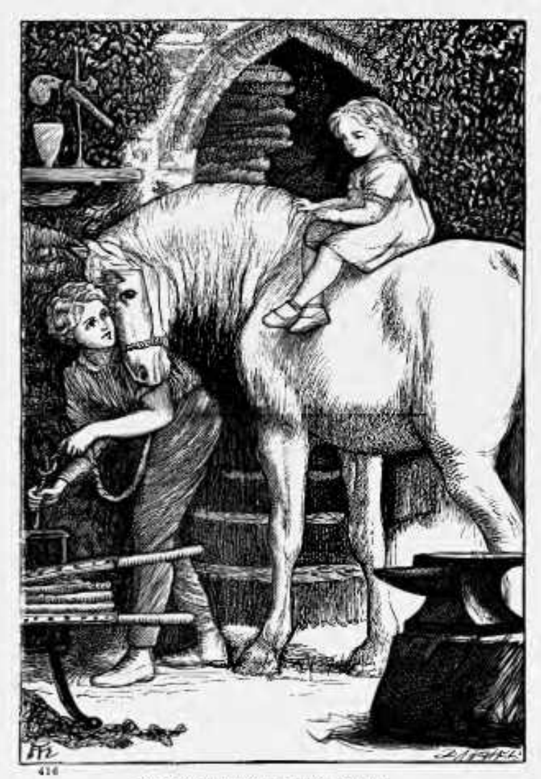
WILLIE'S HORSE-SHOEING FORGE.