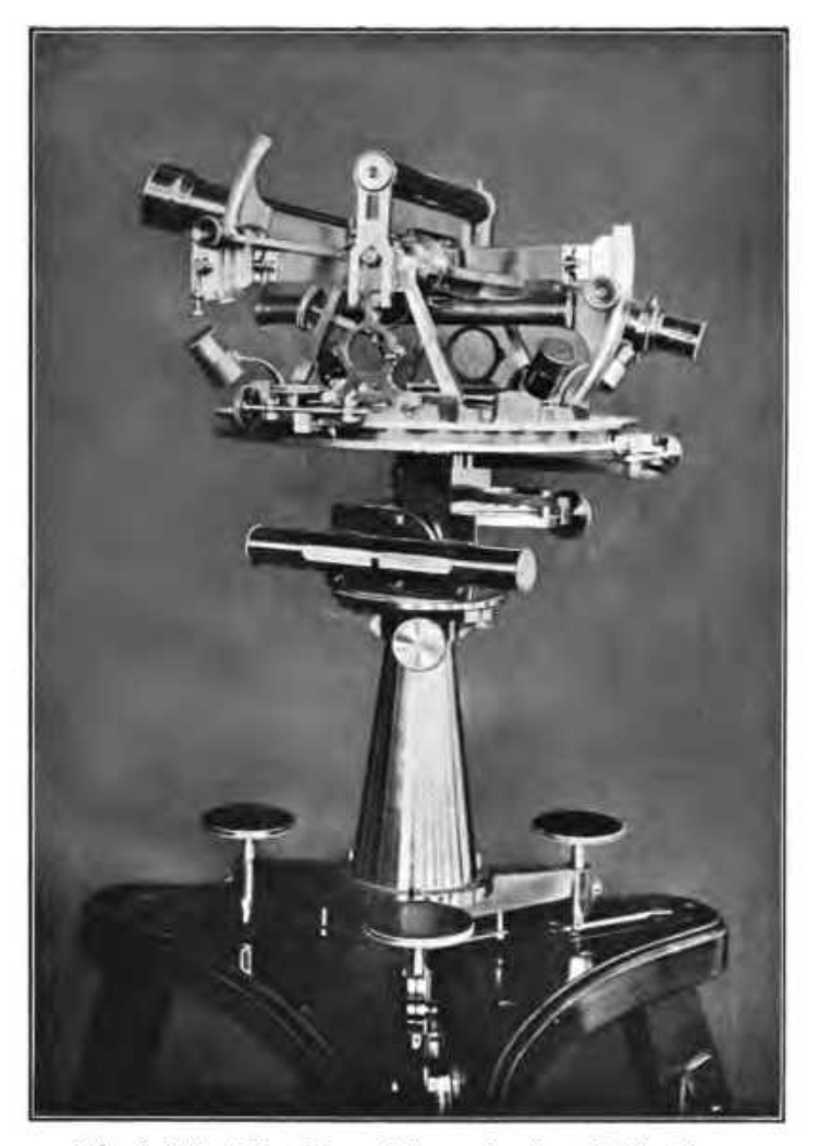
Old 10-inch Theodolite of Everest design, used on the early Indian Survey.

<sup>.</sup> This has an arrangement for disconnecting from and reattaching to the pillar with the horizontal circle vertical so as to enable vertical angles beyond the range of the vertical segments of arc to be taken when required.