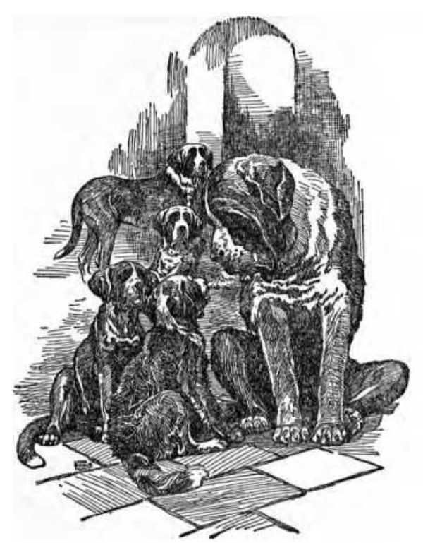
"The duty of a St. Bernard is to ease lives and be worthy of his ancestors."