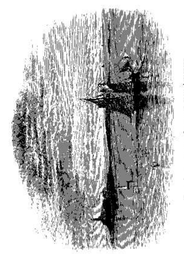
WHITE ISLAND, LOOKING SOUTHFRAT FROM AFPLETORIES.