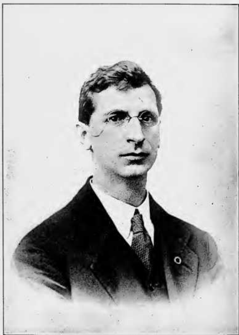
EDMUND DE VALERA

First President of the Irish Republic as declared by Sinn Fein